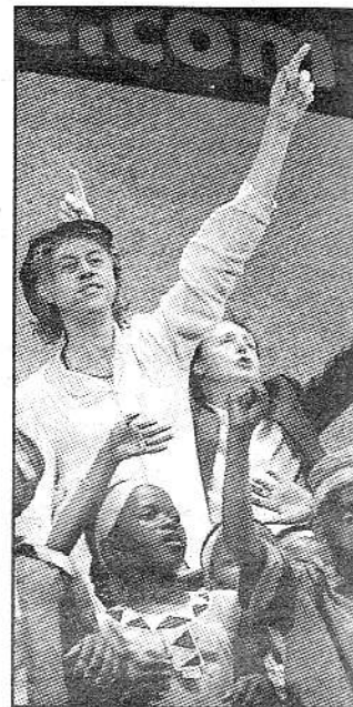
CALL FOR ACTION: Bob Geldof at the Live 8 show

"Just a few years ago, this service came from one room and was used by a handful of people.