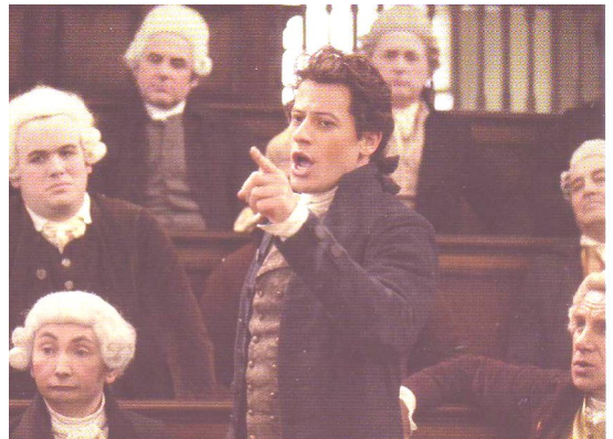
Ioan Gruffudd as Wilberforce

The Magnitude of the Subject: On 12 th May 1789, ‘a sickly shrimp of a man’, rose to his feet in Parliament and began one of the greatest speeches ever given: “When I consider the magnitude of the subject which I am to bring before the house, a subject in which not only the interests of this country... but of the whole world and posterity are bound up... it is impossible for me not to feel both terrified and concerned at my inability to such a task.” The man was William Wilberforce, and he was proposing the abolition of the slave trade – a measure that would finally be passed eighteen years later.