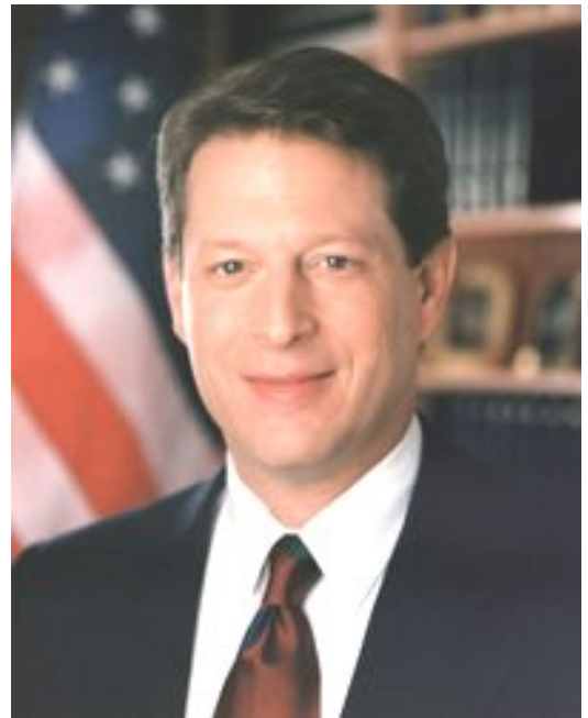
Al Gore, when Vice-President, 1994